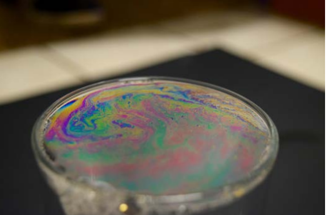
Figure 3: Original Soap Film Photo